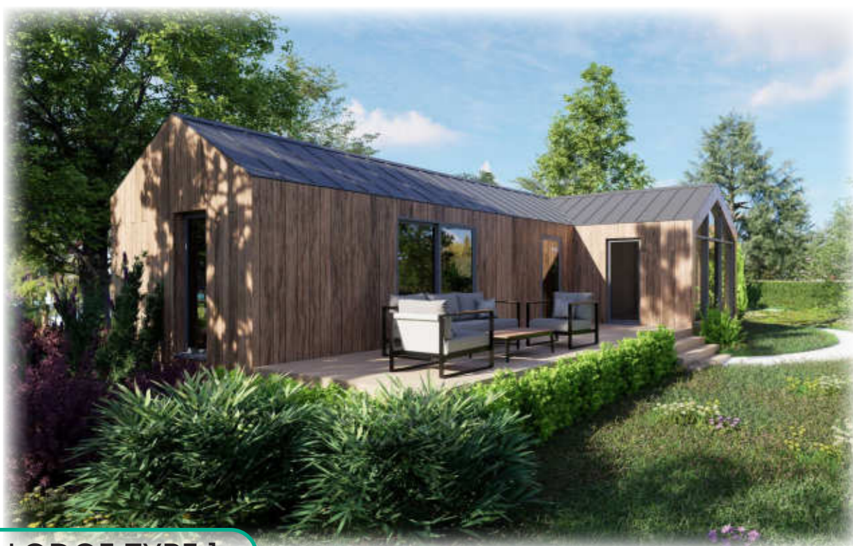
LODGE TYPE 1