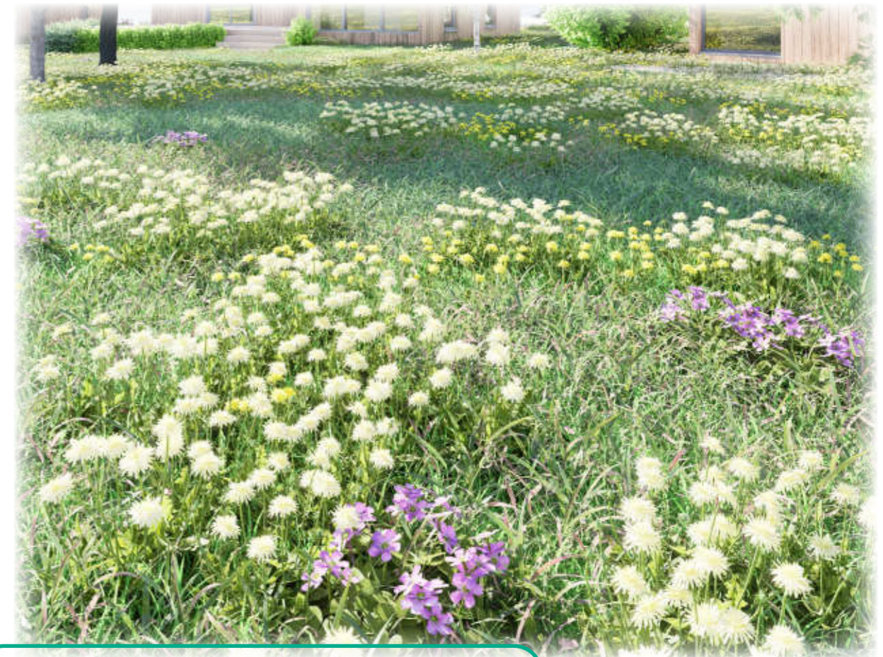
Pasture Planting: A covering of buttercups, daisies and clover in the grass sward