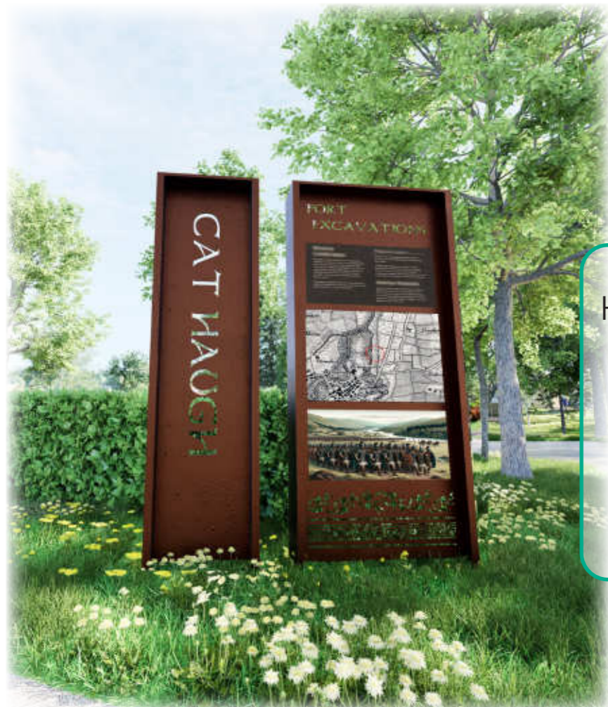
ARCHAEOLOGY: Heritage and Archaeological assets celebrated with paths and trails including interpretive boards and wayfinding to link to the wider Dalkeith Historical Tour and established Trails and waymarked walking routes