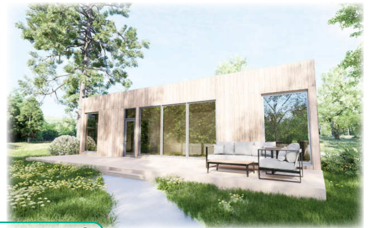
LODGE TYPE 3