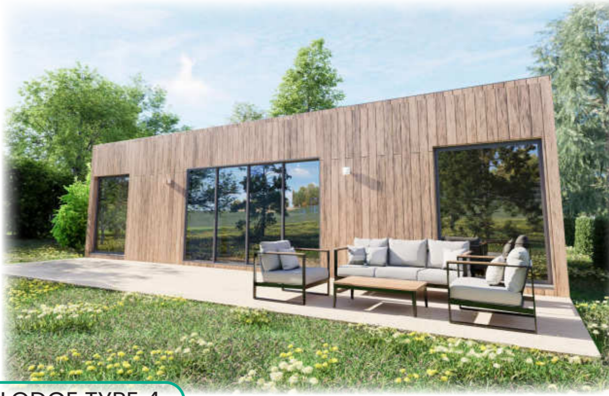
LODGE TYPE 4