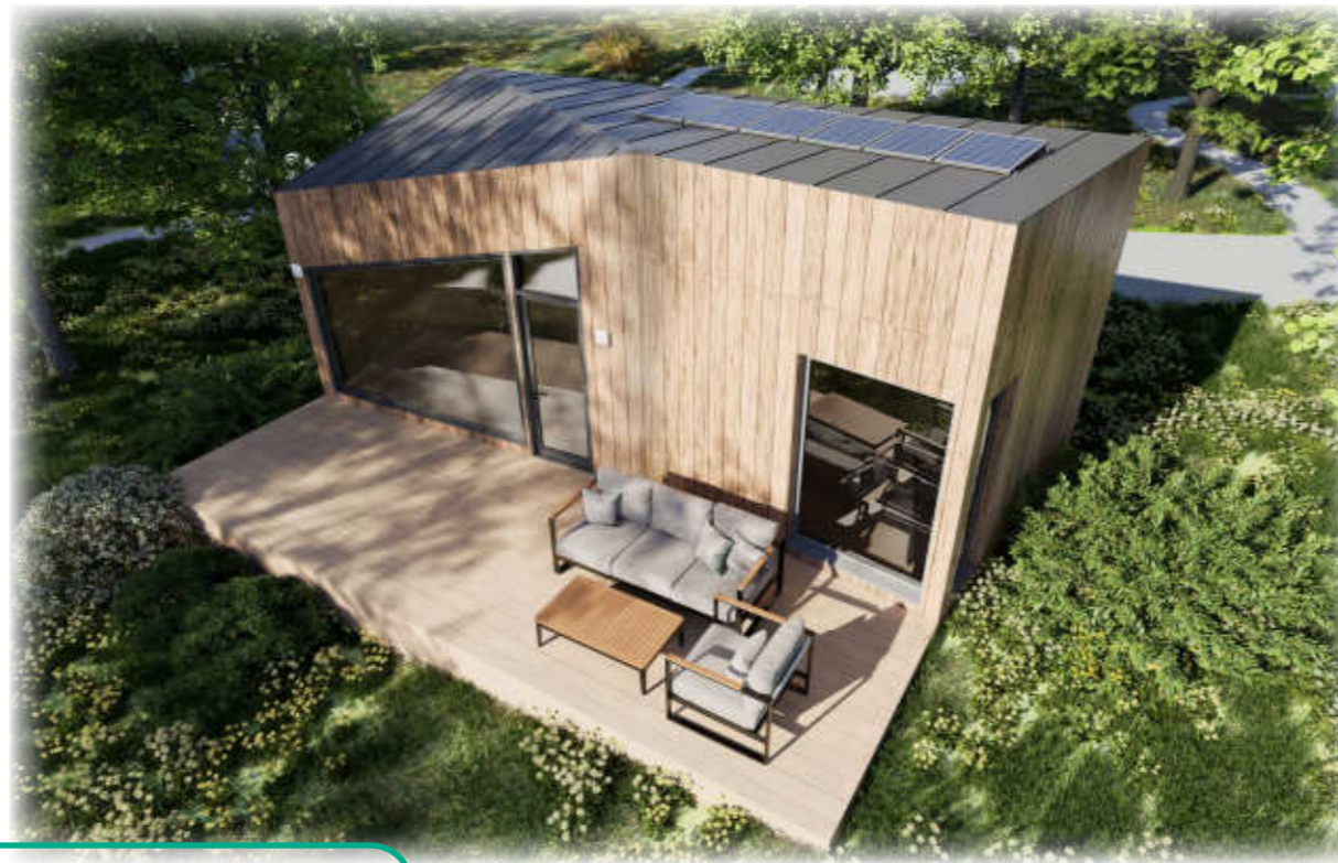
LODGE TYPE 2