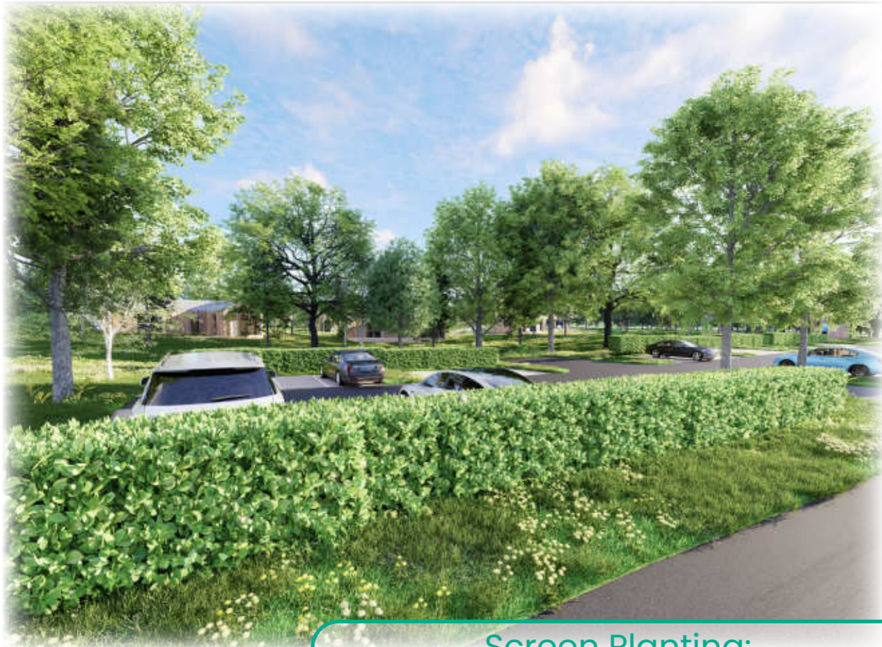
Screen Planting: Parking arranged in screened landscape settings using Beech hedges to compliment existing hedges that line the lanes