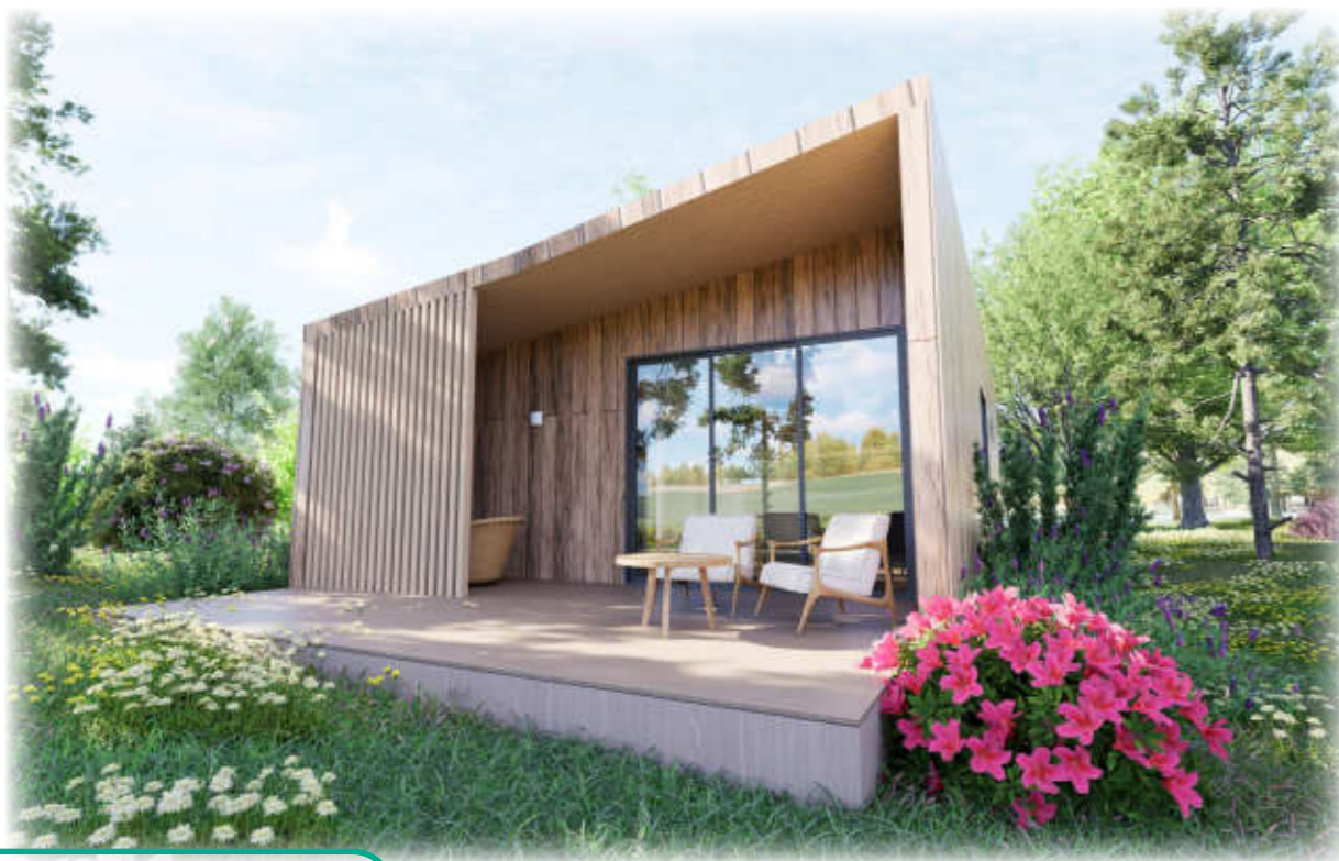
LODGE TYPE 5