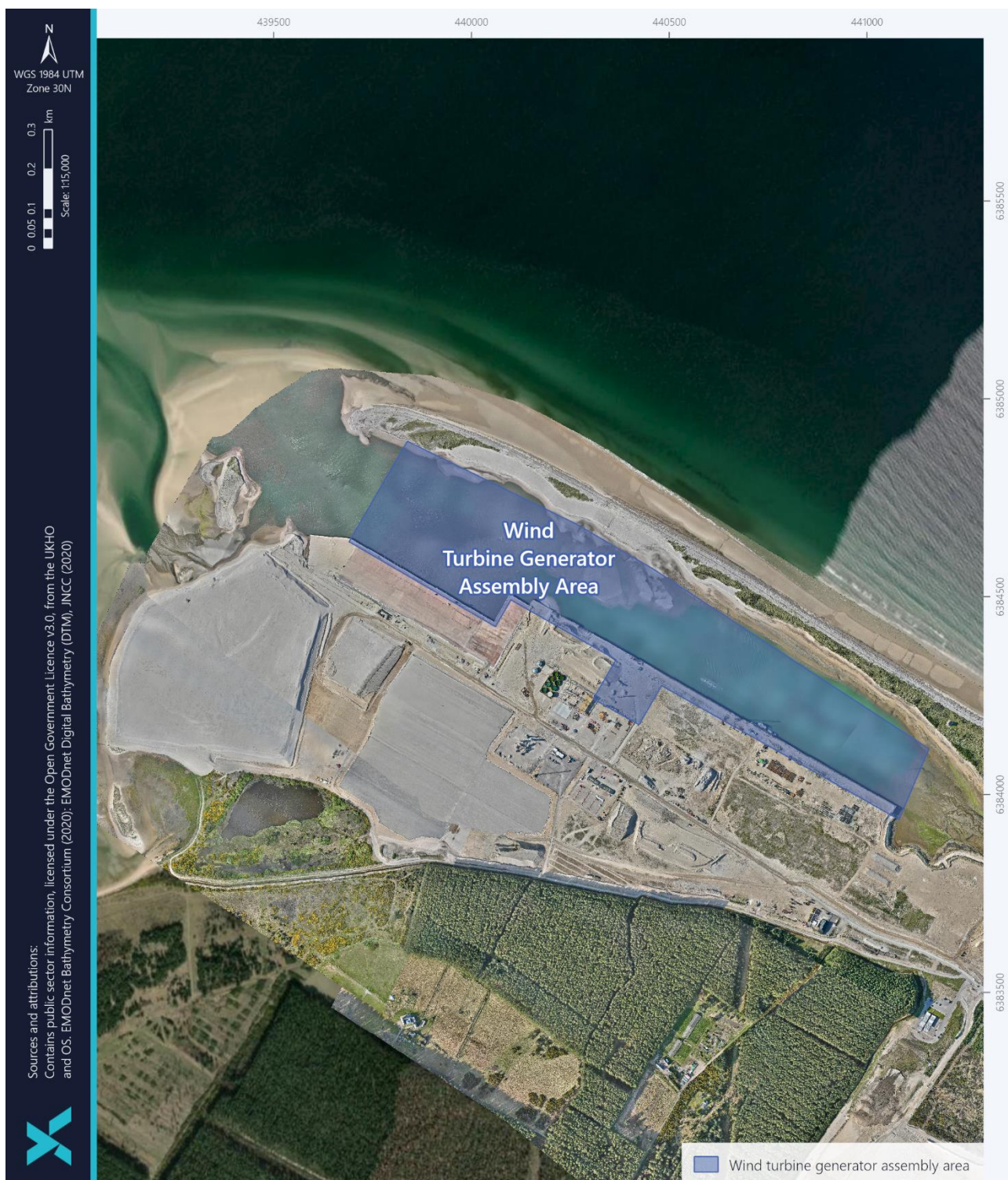
Figure 1 Ardersier Port WTG assembly location